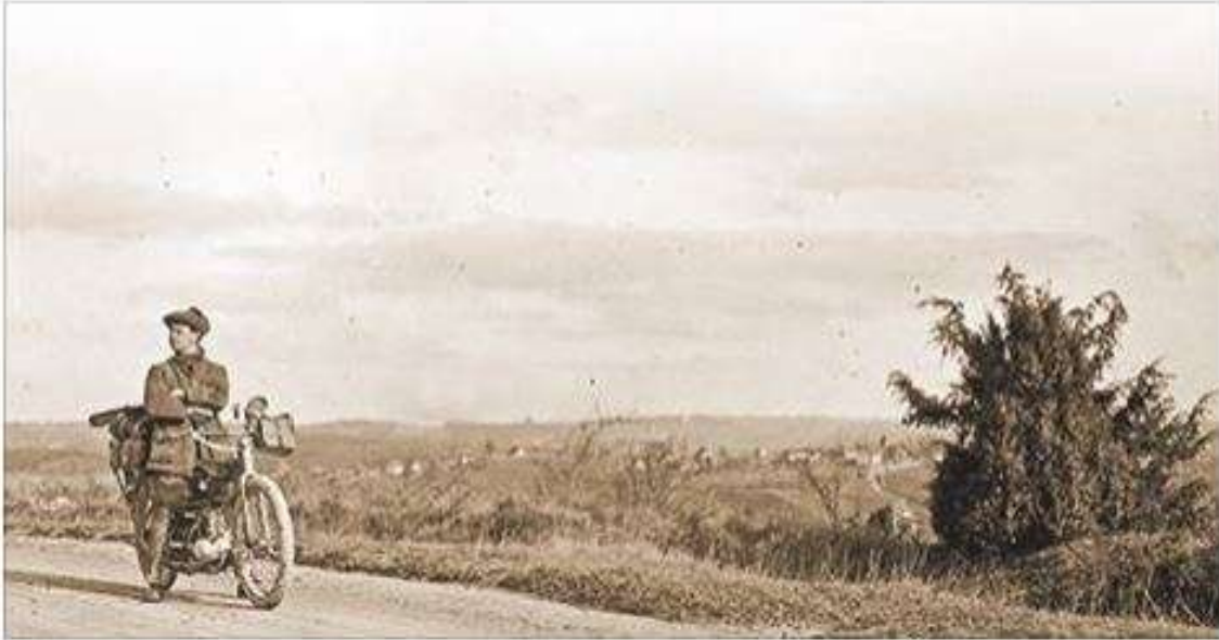
Clancy's Conquest: The First Ride Around the World

Learn more about Carl Clancy's first motorcycle ride around the world! http://www.ridermagazine.com/touring-and-rallies/clancys-conquest-the-first-ride-around-the-world.htm/