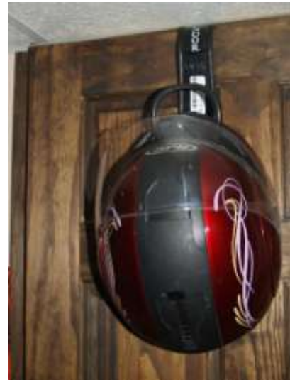
Full Face Helmet

Hang your helmet virtually anywhere. The solid style hanger easily mounts to any wall, trailer, or solid surface. The universal style can be used on closet rods, cubicle walls, doors or anything that the hanger will fit over. Works well with any style helmet, both open and full face. Constructed with hot rolled 1/8" steel with a black finish and a rubber strip around the edge. $15.