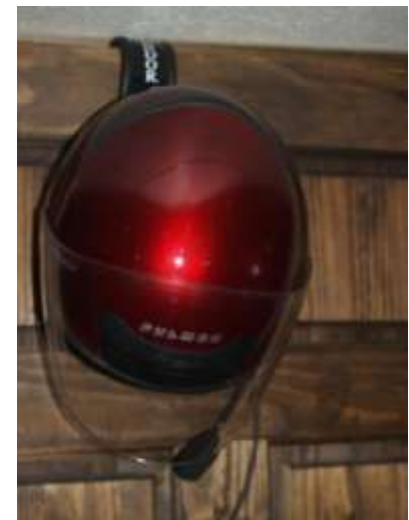
Open Face Helmet